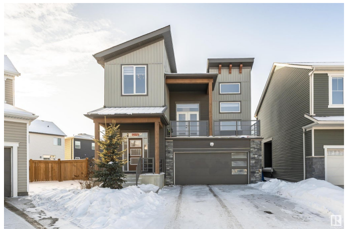
1603 202 St NW, Edmonton, AB