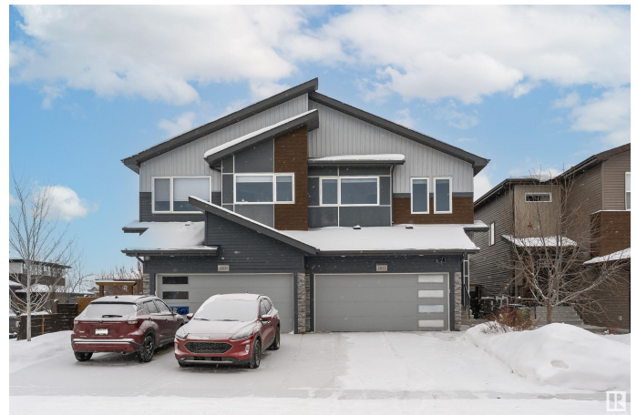
2833 Koshal Cres SW, Edmonton, AB

Main Floor Exterior Area 108.260 m 2 Interior Area 63.211 m 2 Excluded Area 38.36 m 2