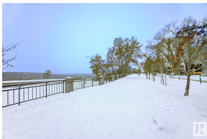
1701-11710 100 Ave NW, Edmonton, AB